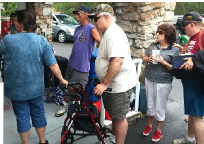
ECL's Beacon Lodge camper checking in on July 30