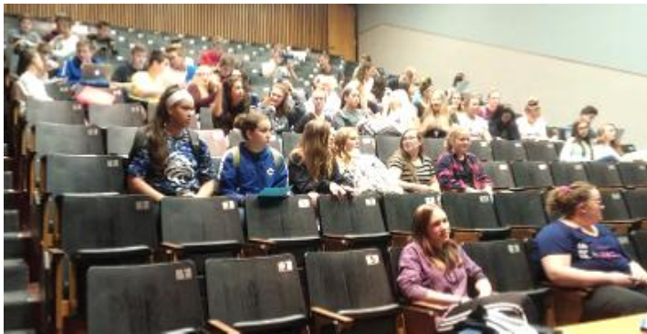
The 2018 "pride" of LEOs