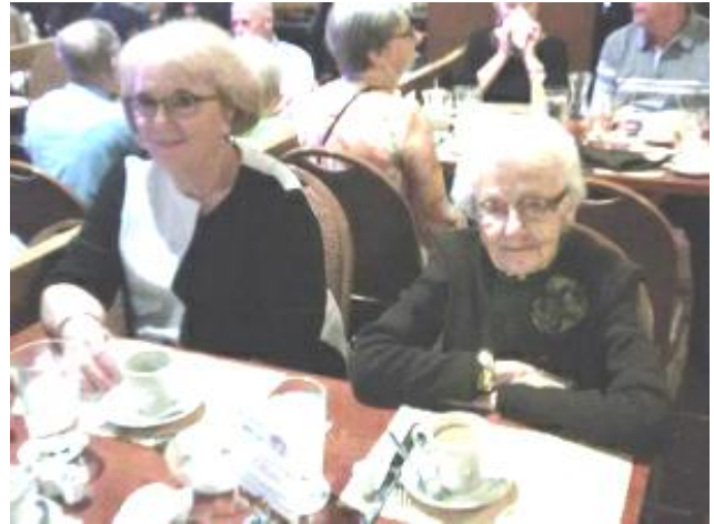
The lady on the right is 100+ years young!