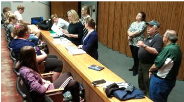
Faculty & ECL advisors to the 2018 LEOs