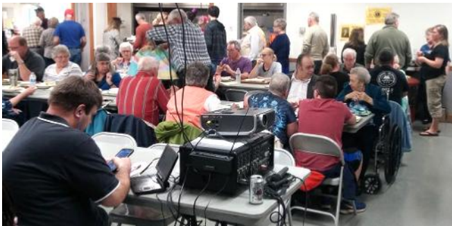
...and some 50/50 action