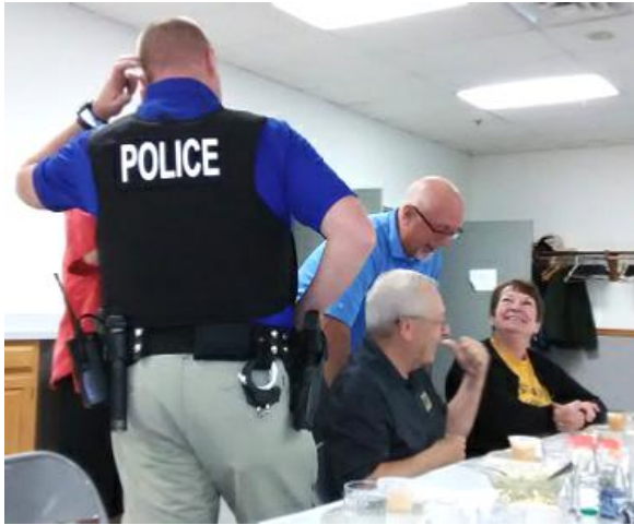
Is this a raid?