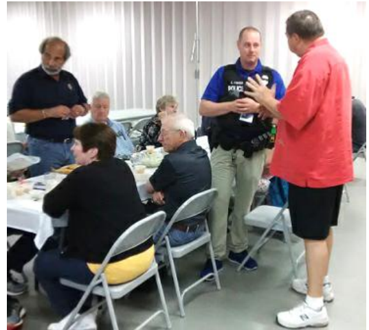
...about that parking ticket...?