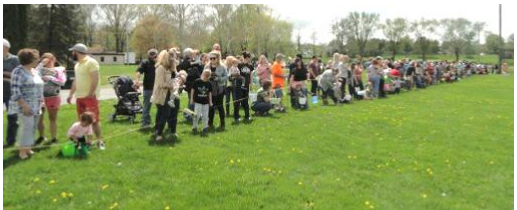
<< a new Bunny in R'town?