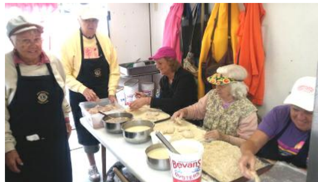
...where the magic happens