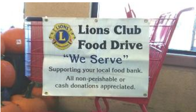
Friday & Saturday, October 26&27 Area Lions Clubs for the benefit of Ephrata Area Soc Svcs