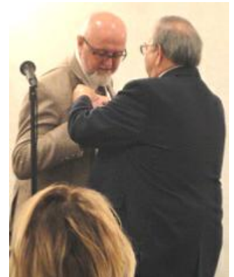
Pinning the new Prez