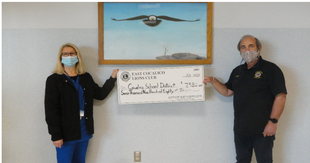
Grant Check distributed to Cocalico School District To help cover cost of Updated COVID approve eye Screening Machine