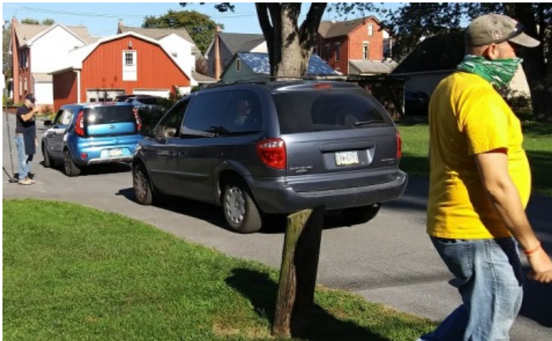
Meal Pick-up Booth