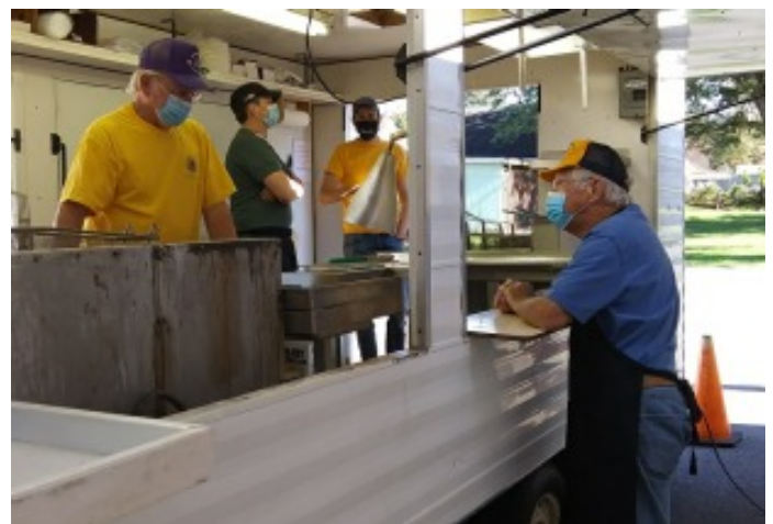
Preparation and Frying Booths