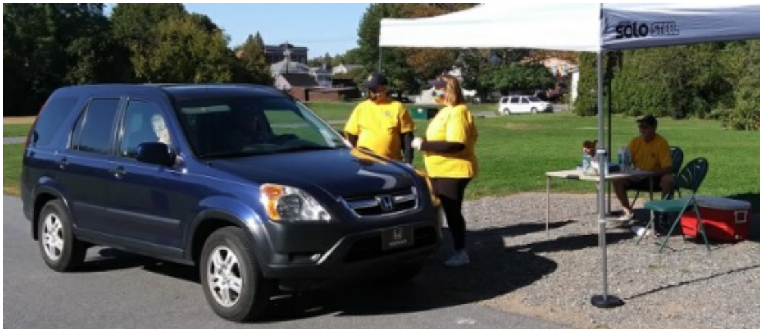
Ticket Pay Booth