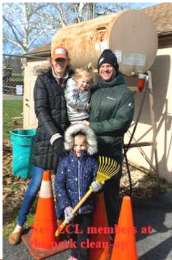
ECL members at the park clean-up