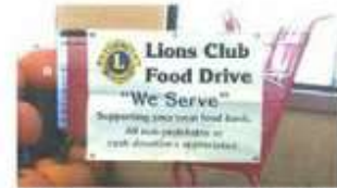
Food Drive at Weaver's Market May 20 & 21, 2022