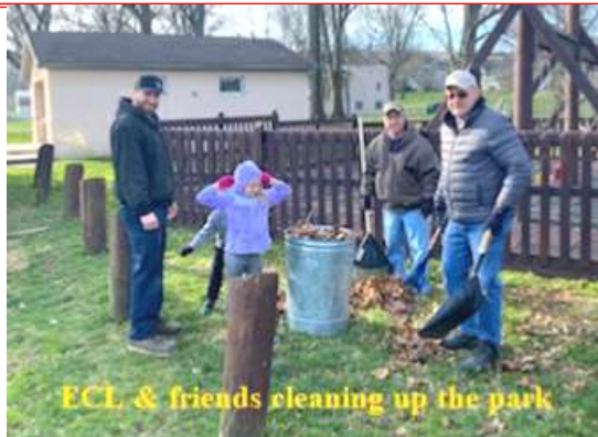
ECL & friends cleaning up the park