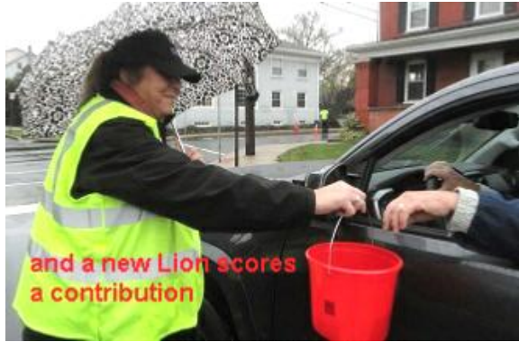
and a new Lion scores a contribution

It’s certainly not the time of year for balmy pleasant weather, but HOW COLD, HOW WINDY?