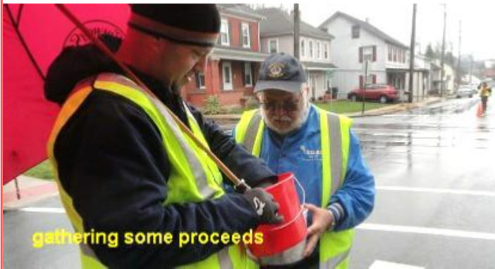
gathering some proceeds