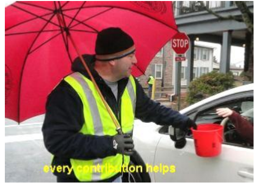
every contribution helps