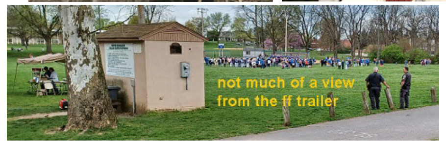
The Senior Citizens event used to be a banquet, then a picnic, now a luncheon(?) with entertainment: