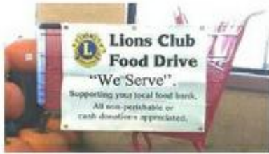
Food Drive at Redner's Market May 12 & 13, 2023