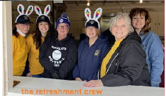
the refreshment crew

ECL didn't have the resources to conduct the annual Egg Hunt, cancelled the event — and the community responded. Coordinated through ECL a number of groups & individualxs got it done. Yea, Reamstown!