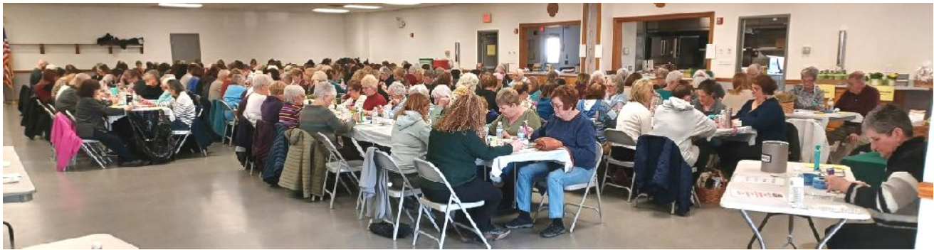
Among the organizations we support & services ECL provides: PA system for Adamstown Library Bingo

We are proud to have "Lion" as part of the EASS vehicle family. #LionsClub #community #stronger