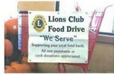
Food Drive at Weaver Markets May 12 & 13, 2023