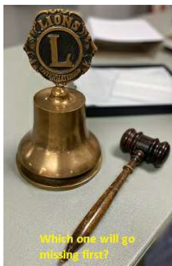
Which one will go missing first?