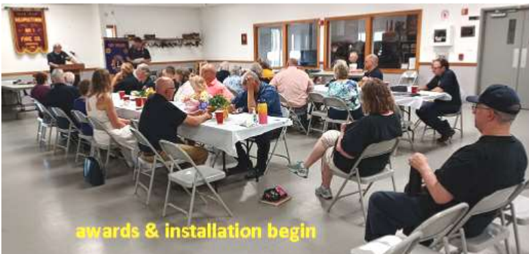
awards & installation begin