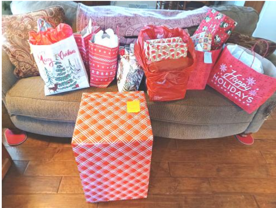
The gifts donated by ECL members for the four families of the EASS Holiday Exchange program!