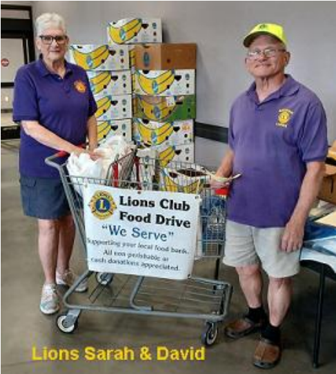
Lions Sarah & David