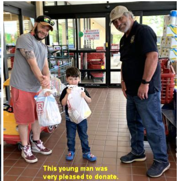
This young man was very pleased to donate.