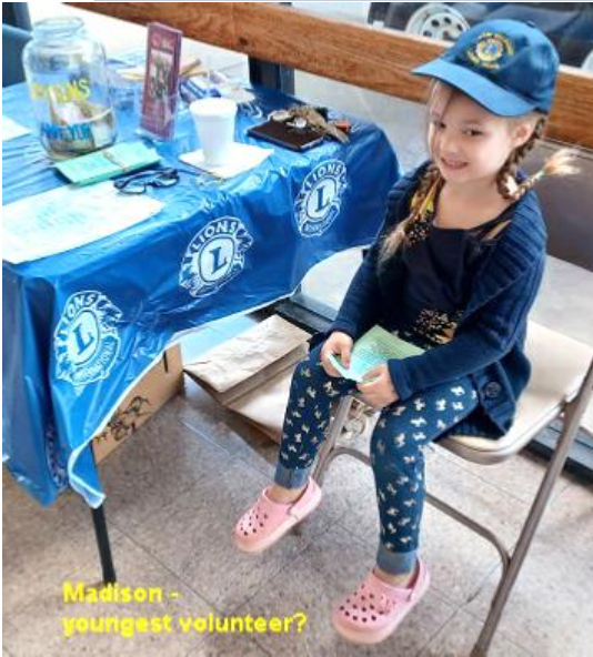
Madison - youngest volunteer?