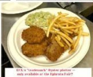
ECL's "treasure" Oyster platter -- only available at the Ephrata Fair!