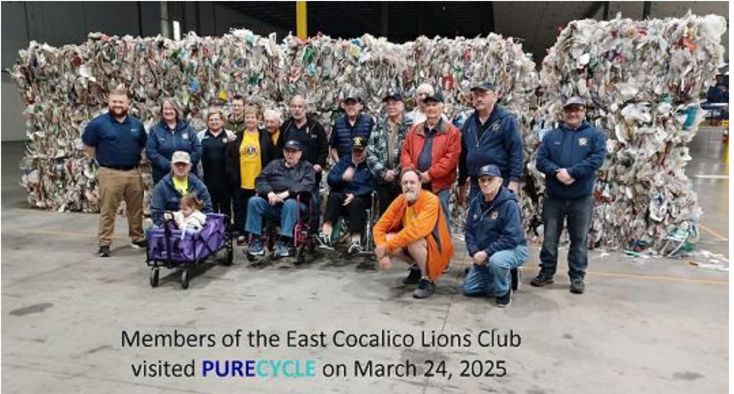
Members of the East Cocalico Lions Club visited PURECYCLE on March 24, 2025

The weather somewhat cooperated for the park cleanup day (April 5th). There were 24 people that came out to help with 2 Lions participating as well. Winning Touch Nursery provided a free truck load of sand for the sand box. ( if you stop in at Winning Touch, acknowledge their generous donation)