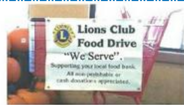
Food Drive at Redner's Market October 25 & 26, 2024