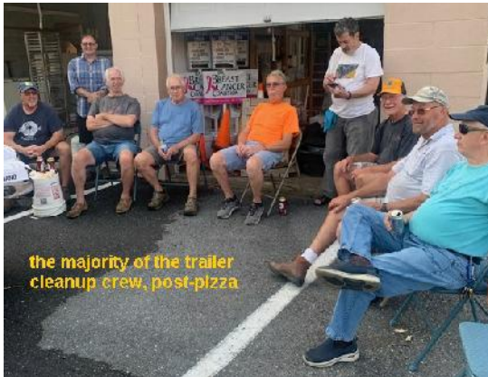
the majority of the trailer cleanup crew, post-pizza