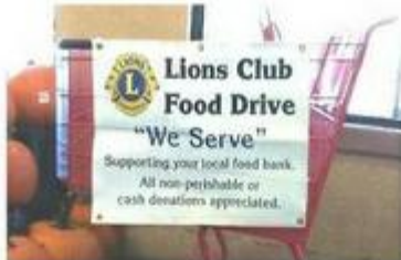
Food Drive at Weaver Markets October 25 & 26, 2024