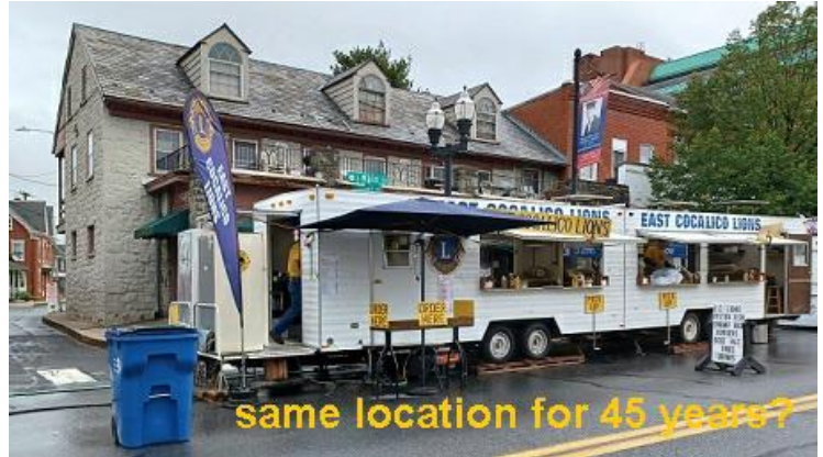
same location for 45 years?