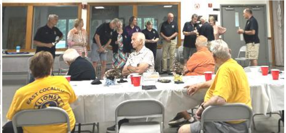
The line-up, officers & Board Members for 2025-2026