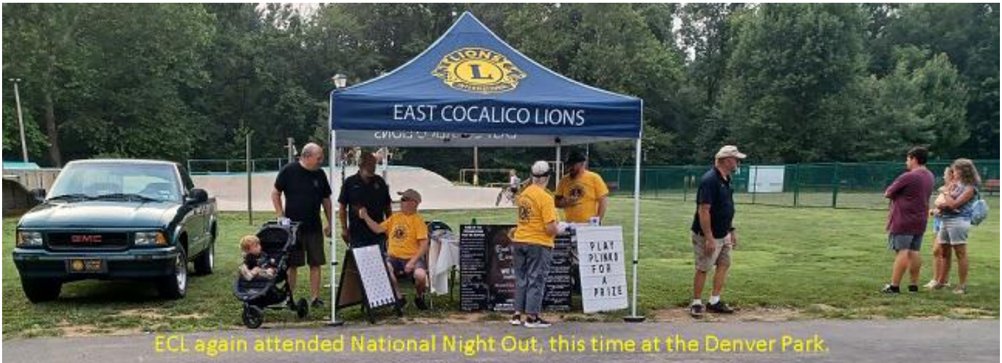
ECL again attended National Night Out, this time at the Denver Park.